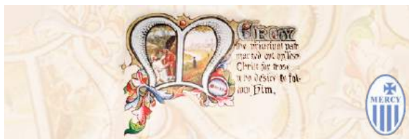
Heart of Mercy Committee Prayer – Mercy Charism